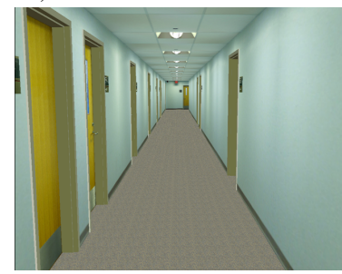
Figure 1: the virtual hallway environment used in the experiment.

(for ordinary walking). The navigation methods were presented in a balanced order between subjects using Latin squares and we explicitly avoided describing the methods in any way, not even by name, to avoid inadvertently biasing or otherwise influencing participants' opinions or ratings. At the beginning of each trial, participants were simply instructed to point the wand, which was also tracked with the HiBall system, in the direction they wished to travel, press the trigger (which activated the augmentation of the tracker output in modes B and G, and controlled the direction and duration of travel in mode J), and, except in the case of method J, to begin walking. After traversing the hallway from end to end using each navigation method, participants were given a short survey in which they were asked to 1) identify the methods that they liked best and least overall; 2) rate each of the methods on a seven point scale according to various criteria; and 3) provide written comments relating what they liked and didn't like about each navigation method. We created separate surveys for each possible presentation order, so that each participant would answer the questions about the methods in the order that s/he had experienced them (to minimize any opportunity for confusion between methods).